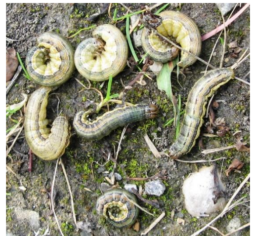
Figure 4. Armyworm larvae

Guidelines for monitoring larvae of armyworm can be found at: https://www.gov.mb.ca/agriculture/crops/insects/pubs/armyworms-factsheet-revised-january2024.pdf