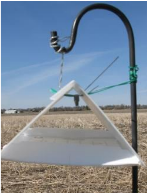
Figure 1. Trap for diamondback moth

Pheromone-baited traps (Fig. 1), which attract the male moths, are established for a 6-8 week period from early-May until late-June to detect the arrival of populations of diamondback moth early in the season. The cumulative counts from the traps, and how early larger numbers of moths arrive, cannot predict what levels of larvae will be, but can be used to determine regions of the province where increased attention for diamondback moth is recommended when scouting fields.