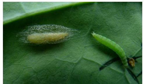
Figure 4. Diamondback moth pupa (left) and larva (right).

Guidelines for monitoring larvae of diamondback moth can be found at: https://www.gov.mb.ca/agriculture/crops/insects/pubs/diamondback-moth-factsheet.pdf