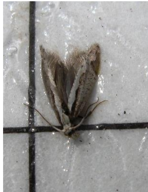
Figure 2. Diamondback moth on insert of trap