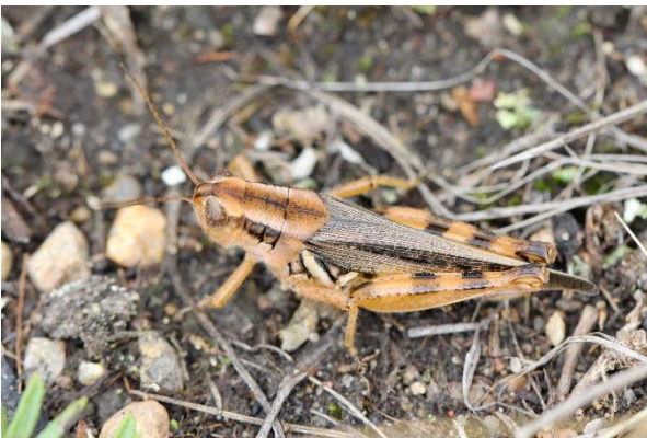
Figure 4: Melanoplus packardii , Packard's grasshopper.

Packard's grasshopper is typically a rangeland species but is well-adapted to cropland. They feed on both broadleaf plants and grasses. They prefer legumes but can be damaging to small grain cereals and vegetables. They will also consume dead insects. Adults are dark gray, brown or yellow-brown above and yellowish below (Figure 4). A diffuse dark stripe extends from the top of the head over the top of the pronotum. The forewings are grayish brown, usually with a few small spots. The hind femora are yellowish with a dark stripe along the upper edge. Males are 22 to 23 mm long; females range in length from 26 to 37 mm.