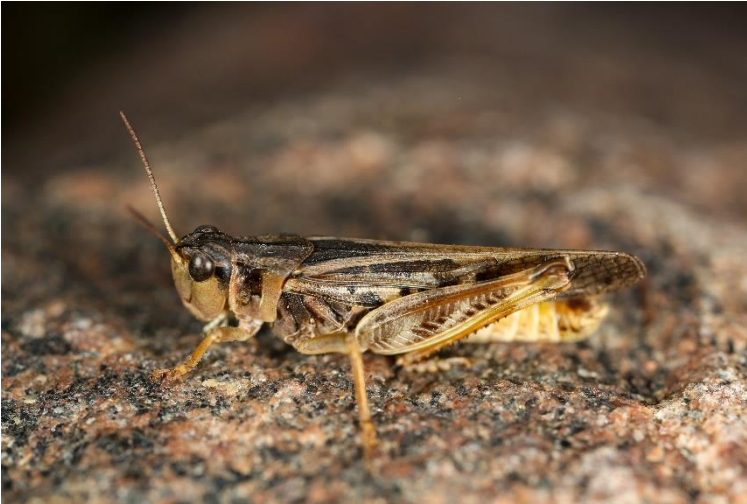
Figure 6: Camnula pellucida , the clear-winged grasshopper.