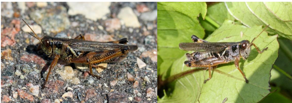
Figure 5: Two examples of Melanoplus bruneri , Bruner's grasshopper.

Adults are pale to dark brown (Figure 5) and can be difficult to distinguish from other Melanoplus species. Males are 18 to 22 long; females range from 22 to 27 mm in length.