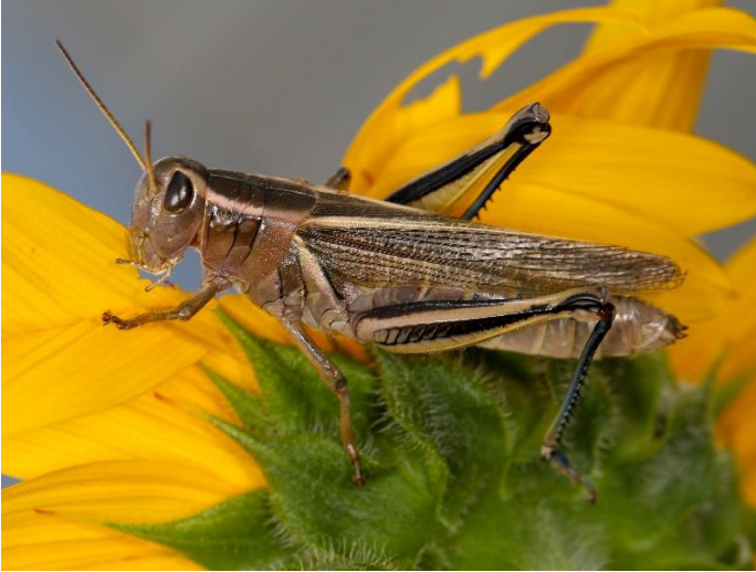
Figure 3: Melanoplus bivittatus , the two-striped grasshopper. Note the stripes along the back and legs.