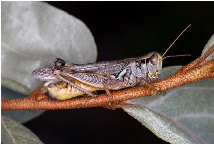
Figure 2: Melanoplus sanguinipes , the migratory grasshopper.

Nymphs feed for about a month before reaching the adult stage. Egg-laying begins about a week after the female reaches adulthood. Females lay 200-400 eggs in pods (approximately 20 eggs per pod) from late July into the fall. They use their ovipositor to insert egg pods about 5 cm deep. Eggs begin to develop after being laid, with most development typically occurring in the summer that eggs are laid and the remainder occurring in spring of the subsequent growing season.