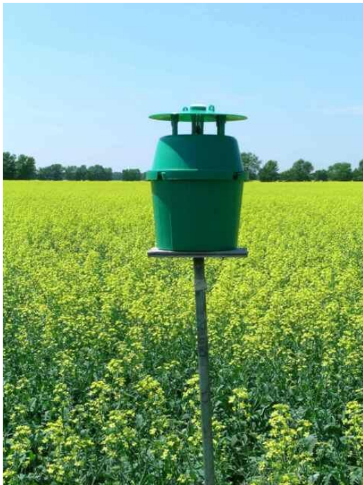
Figure 1. Trap for monitoring bertha armyworm

The cumulative moth counts from the traps, which are presented in the table below, can not predict what the level of larvae will be in the field a trap is in, but can be used, in conjunction with counts from other traps in a region, to determine areas of the province at higher risk and where increased monitoring of fields for larvae may be necessary.