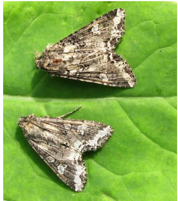
Figure 2. Bertha armyworm moths