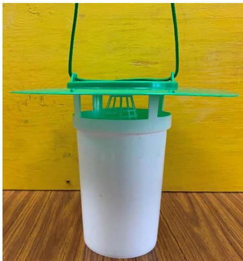
Figure 1. Trap for armyworms

Pheromone-baited traps (Figure 1), which attract the male moths, are established for a 12-week period from early-May until late-July to detect the arrival of populations of armyworms early in the season. The cumulative counts from the traps cannot predict what levels of larvae will be, but can be used to determine regions of the province where increased attention for armyworms is recommended when scouting fields of cereals and forage grasses.