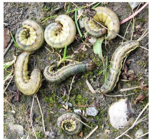
Figure 4. Armyworm larvae

Guidelines for monitoring larvae of armyworm can be found at: https://www.gov.mb.ca/agriculture/crops/insects/pubs/armyworms-factsheet-revised-january2024.pdf