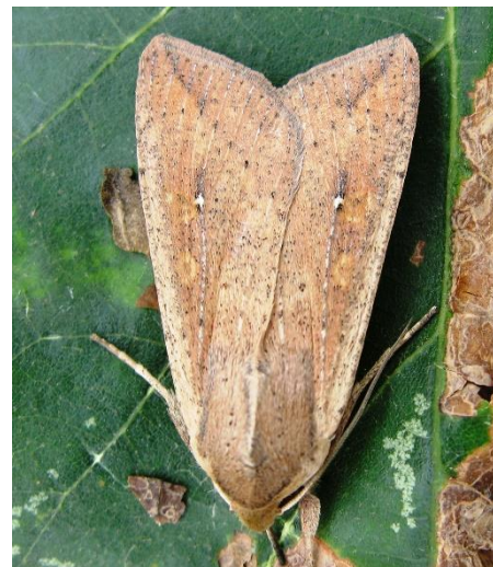
Figure 2. Armyworm moth