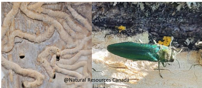
@Natural Resources Canada